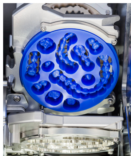
8-fold disc changer