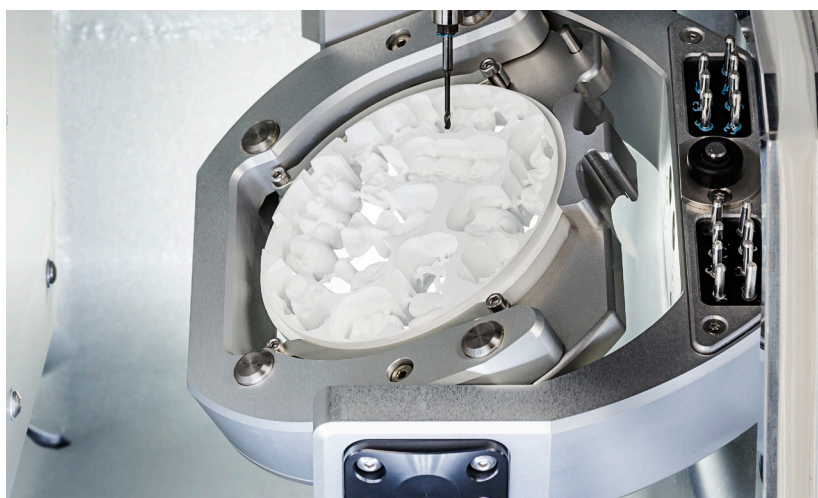
5-axis machining with 16-fold tool changer