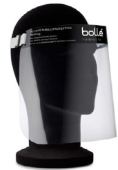
Bolle Face Shield DFS4 Clear Visor & Adjustable Headband BL-PFSDFS4107S Each