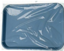
Henry Schein Tray Barriers HS101-4275 10.5 x 14" , Pkt 500