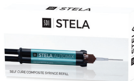
AUTOMIX REFILL - 8640001