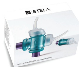
CAPSULE REFILL - 8640003