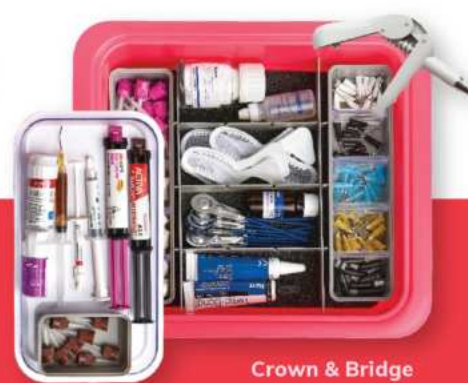
Crown & Bridge