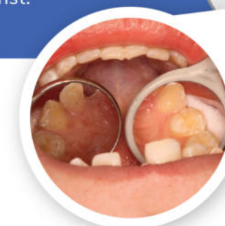
Rhodium Mirror vs Crystal HD®

Made from advanced resin, it resists corrosion, eliminates galvanic shock, and withstands repeated sterilization without dulling or distortion. Choose from multiple sizes and colors to fit your system and your style. Because when your tools work as hard as you do, confidence comes standard.