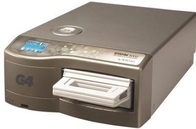
Coltene Scican Statim 2000 G4 $11,000 $12,240 SCI-G4222314