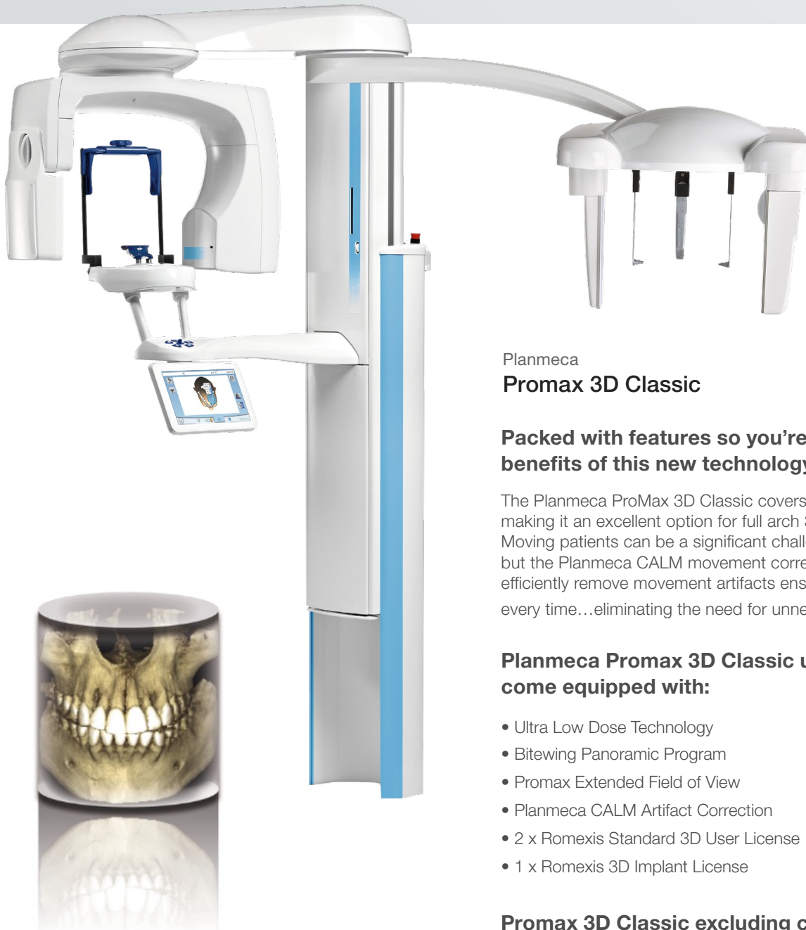
Planmeca Promax 3D Classic

Packed with features so you're ready to reap the benefits of this new technology right away.