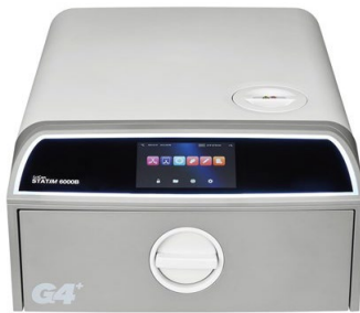
Coltene Scican Statim 6000B G4+ $9,500 $10,500 SCI-G4700009