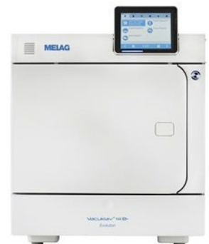
Melag VacuKlav 41 B + Evolution $20,380 $21,880