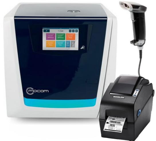
Mocom Australia Supreme 22L