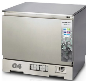
Coltene Scican Hydrim C61 WD G4 Only $12,500 $14,178 • Thermal disinfection at 93°C • Active air drying with HEPA filter • 6 full size cassette capacity • Can turnover 120 instruments in 60 minutes, start-to-dry SCI-C61WDD02