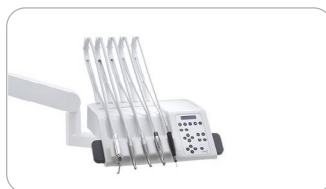
Dual Balanced Swing Arm