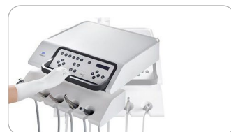
Central Axis Table