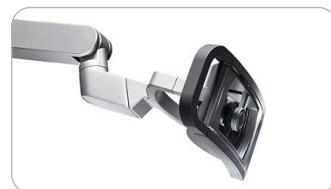
30,000-lux Luna Vue TS