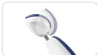
Ease of use Headrest