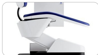
Pantograph Lift Mechanism