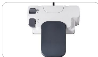
Intuitive Foot Controller